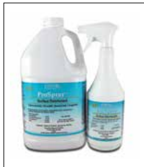
ProSpray™ Ready-to-Use Surface Disinfectant/Cleaner