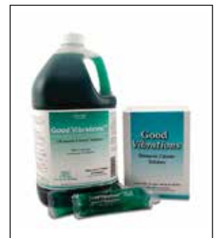
Good Vibrations™ Ultrasonic Cleaner Solution