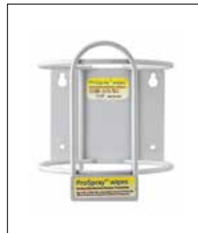
ProSpray™ wipes Canister Bracket Fits All Certol Canisters