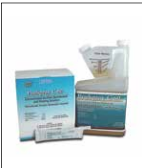
ProSpray C-60™ Concentrated Surface Disinfectant/Cleaner

Other products available from Certol include: